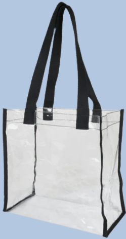
CLEAR BAG PLASTIC, VINYL, OR PVC NO LARGER THAN 12" X 6" X 12"